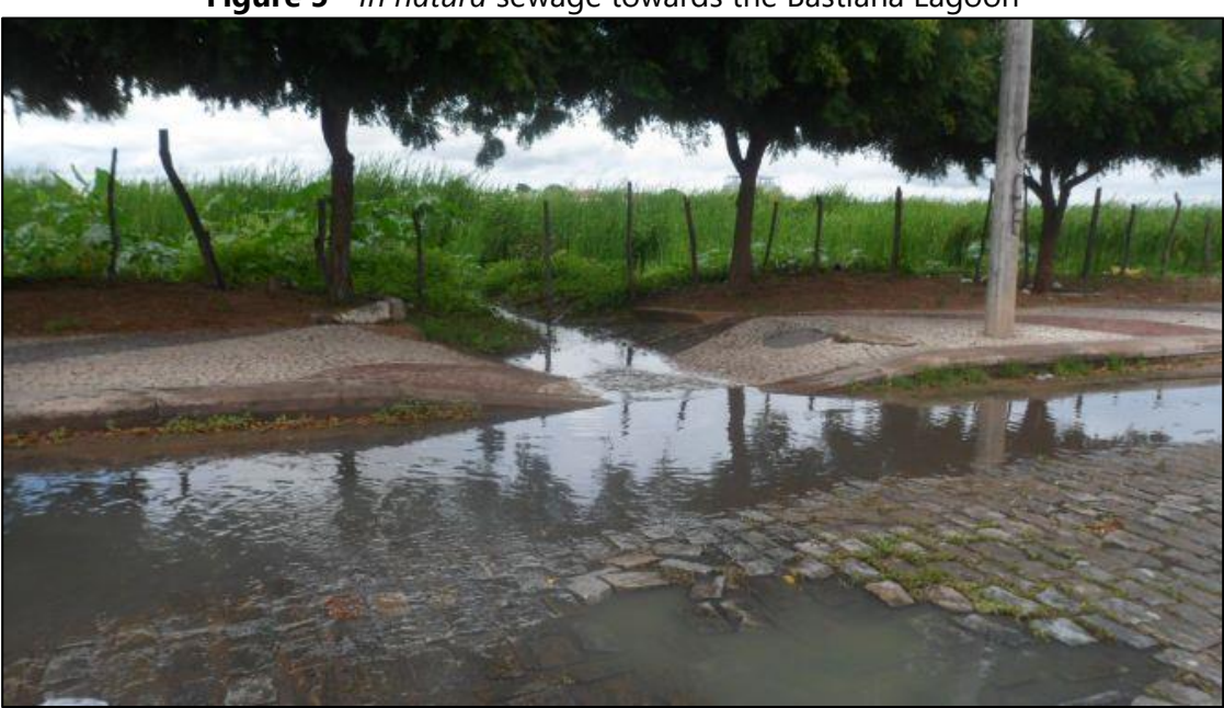
Figure 5 - In natura sewage towards the Bastiana Lagoon