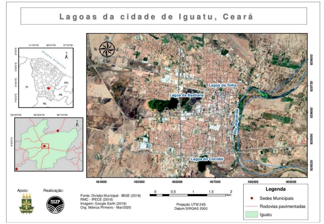
Figure 2 - City of Iguatu and its lagoons

Elaboration: authors. Detail for specific indication of Lagoa da Bastiana in the center, highlighted by a red circle. Source: IBGE (2018) e IPECE (2019).