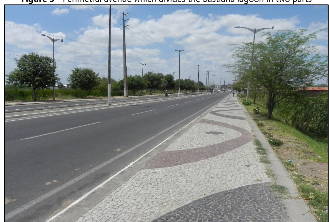
Figure 3 - Perimetral avenue which divides the Bastiana lagoon in two parts

water mirror (also due to effluent emissions in it) and the other portion (west) is normally dry in the months of november and december.